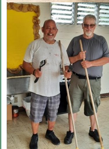
Pic above: The after da Feast late Sunday cleanup gang!