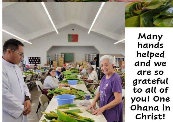
Many hands helped and we are so grateful to all of you! One Ohana in Christ!