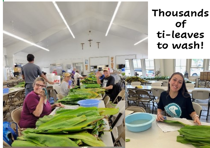
Thousands of ti-leaves to wash!