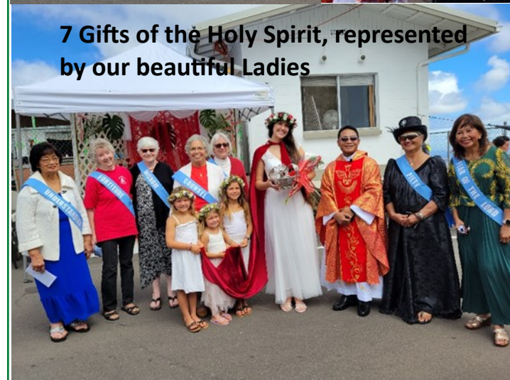
7 Gifts of the Holy Spirit, represented by our beautiful Ladies