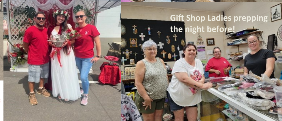
Gift Shop Ladies prepping the night before!