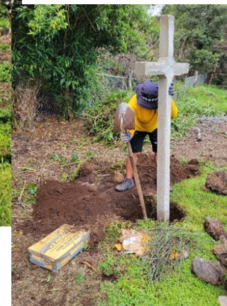
Fr Anton prepping hole