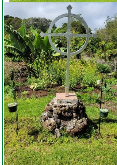
pic of First Station