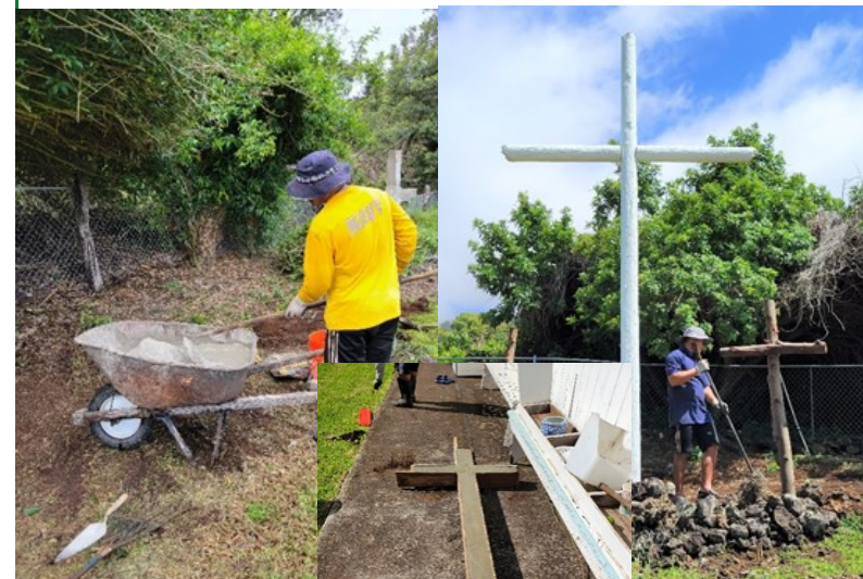
Pic right is used in creating Pic above is prepping cement

Donations for the purchase of fish, fries & tartar sauce gladly accepted.