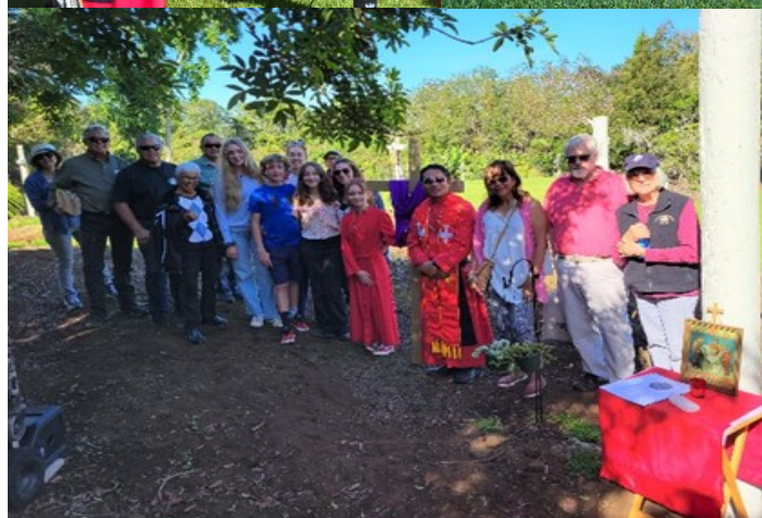
Good Friday Stations of the Cross at OLQA