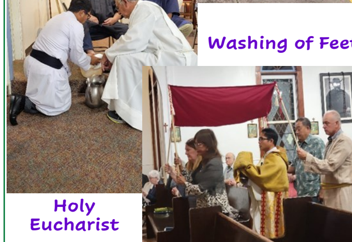
Washing of Feet