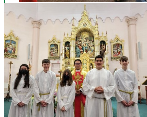
Easter Vigil celebrated at Holy Ghost Church