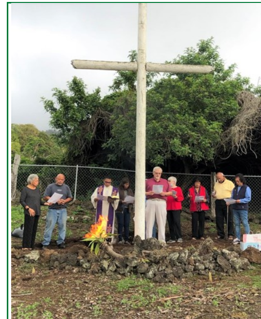
Burning of the Palms Rite in preparation of Ash Wednesday

"Beloved in Christ, in their life these palms drew life from the earth and gave it back to our air and the animals they hosted and sheltered. In the worship of our community, they helped us offer festive joy. Now, as these palms are reduced to ashes for use as we begin our Lenten pilgrimage, we pray they will serve as a sign of our mortality and God's power to save. May we recognize God's love at work in us throughout the holy season before us, replanting our lives in the sure and humble soil of God's truth and grace, so we may once again greet the Christian Passover with joy and gladness." Merciful God, you called us from the dust of the earth, and claimed us for Christ in the waters of Baptism. Look upon us as we prepare for the 40 days of Lent by burning these palms to create the ashes that will mark us as penitents. Bless us through our Lenten journey to the waters of new birth at Easter. (taken from the Rite of B. P.)