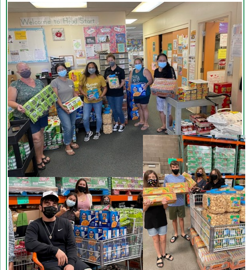
Pics: MEO Staff above, below Youth shopping at Costco.

HUGE THANK-YOU FROM THE M.E.O. STAFF TO THE KULA CATHOLIC COMMUNITY! Mahalo for your generosity in providing food, gift certificates and Maika'I rewards to families in need this Thanksgiving. They are truly grateful!