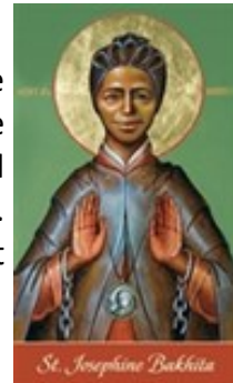
USCCB, "Prayer to St. Josephine Bakhita"

"O St. Bakhita, assist all those who are trapped in a state of slavery; Intercede with God on their behalf so that they will be released from their chains of captivity. Those whom man enslaves, let God set free."