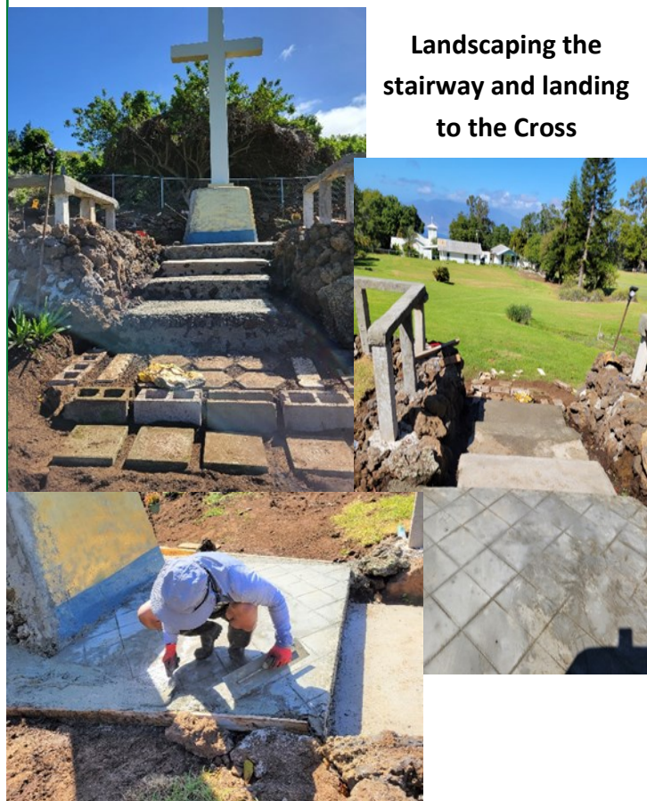
Landscaping the stairway and landing to the Cross

Thanksgiving Basket Shopping God Bless all of you for your donations! We were able to pick up a lot of groceries for families in need at Maui Economic Opportunity!