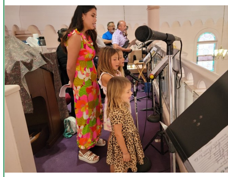
WE ARE ALWAYS LOOKING FOR MORE MEMBERS! COME & JOIN US!