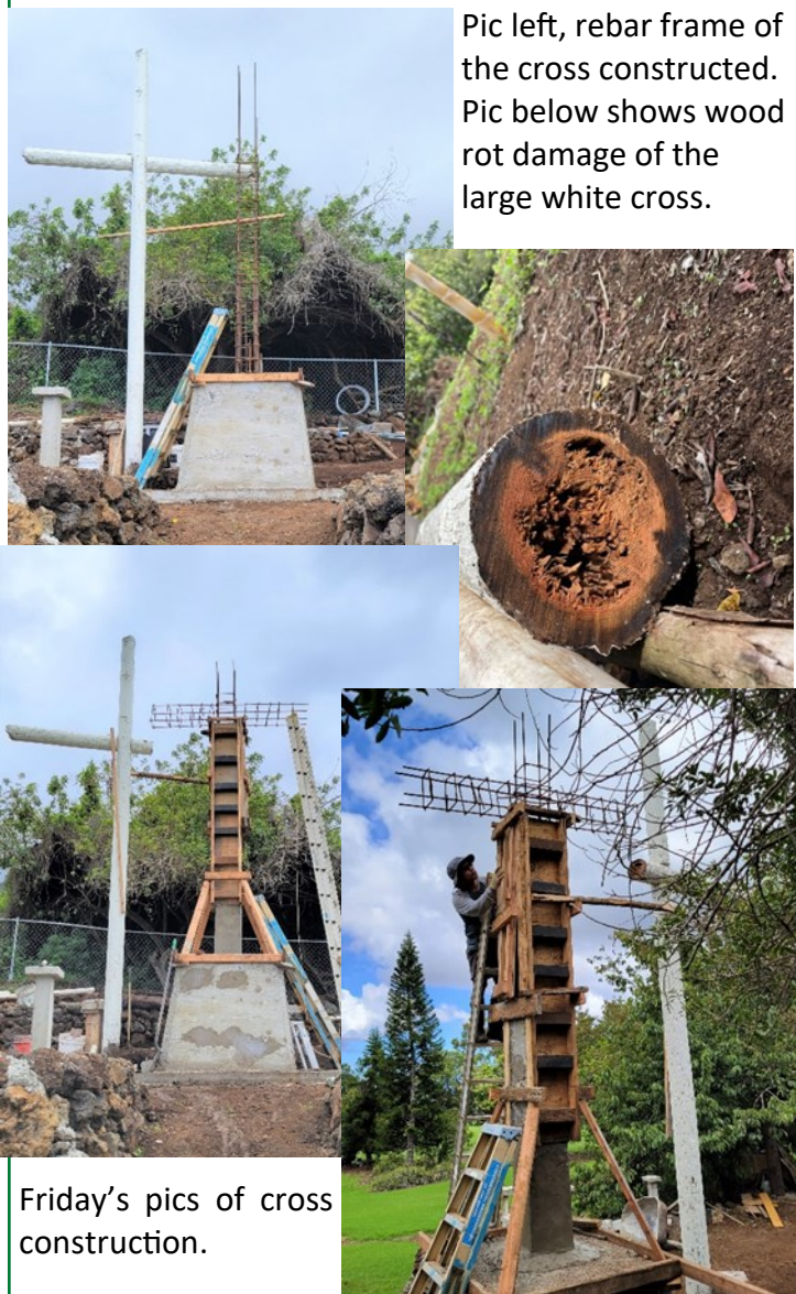
Pic left, rebar frame of the cross constructed. Pic below shows wood rot damage of the large white cross.