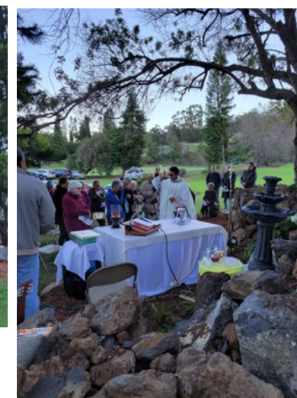
The low temperatures did not deter the faithful from celebrating mass outdoors.