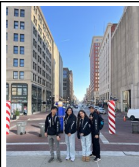
Touring Downtown Indianapolis