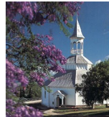
Holy Ghost Church

The Kula Catholic Community, blessed by God, inspired by Jesus and empowered by the Holy Spirit, seeks to worship God with sincerity of heart, witness the Gospel by our words and actions, share Christian values in our personal and community lives, and offer service to all people.