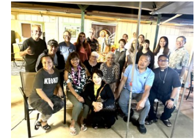
The Lomongo Hale