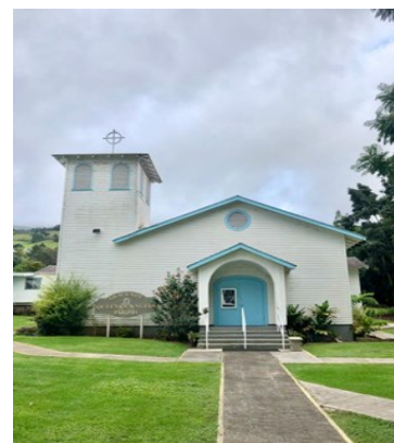
Our Lady Queen of Angels