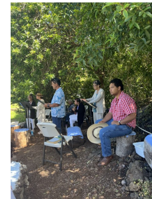
OLQA Choir at the Easter Sunday Mass.