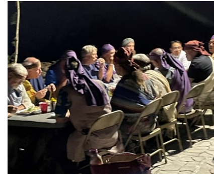
The 12 Apostles having a meal at the Last Supper Table.