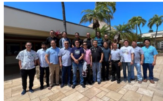
Priests from the Missionaries of La Salette held their annual District Meeting in Kaa-napali after the Easter weekend.