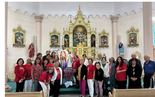
Group photo taken during the Enthronement of the Divine Mercy Statue on March 10.

If your parish celebrates the Mass for the Third Scrutiny for catechumens preparing for Baptism at the Easter vigil, you may hear the Gospel story of Jesus raising his friend, Lazarus, from the dead. One of the many lessons learned from this Gospel story is that of Martha's confession of faith in her friend: "Yes, Lord. I have come to believe that you are the Christ, the Son of God, the one who is coming into the world." Raising Lazarus from the dead was a miracle and a clear display of God's power. It was also an unmistakable sign that Jesus was the Christ. Good stewards of their faith see signs of Christ's presence all around them and are eager to respond in faith. The stewardship question for us is: Who or what will be the Lord of our lives? Will it be Christ Jesus? And if so, how will we respond to him? Are we willing to walk in his footsteps and follow his example?