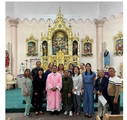
Members of the Christ the King Assumpa Choir sang at the 5:00pm mass.