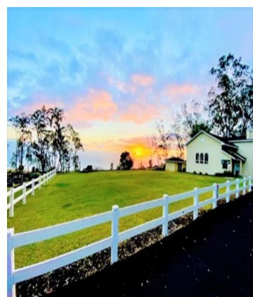
St. James the Less