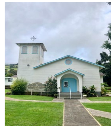
Our Lady Queen of Angels